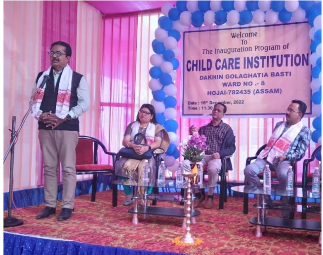
Speech by Joint Director of Health, Hojai on the occasion.