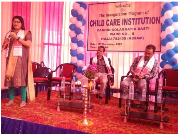
Speech by Child Protection Officer on the Occasion