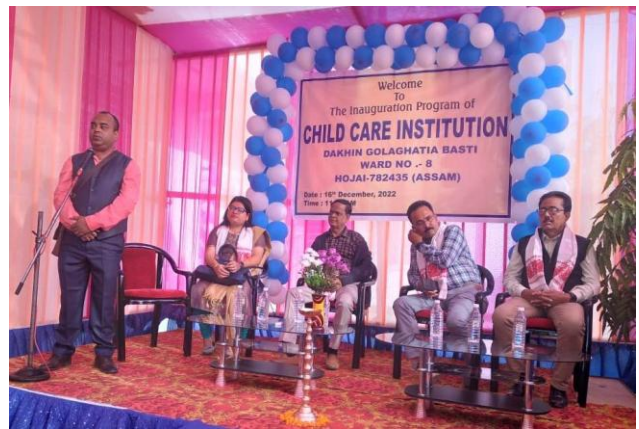
Welcome speech by Secretary of Life Foundation and also highlights about The back ground of the NGO and its future plans.