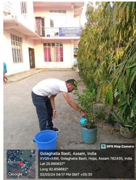
Golaghatia Basti, Assam, India XVQ5+X4M, Golaghatia Basti, Hojai, Assam 782435, India Lat 25.990637° Long 92.858682° 02/03/24 04:17 PM GMT +05:30