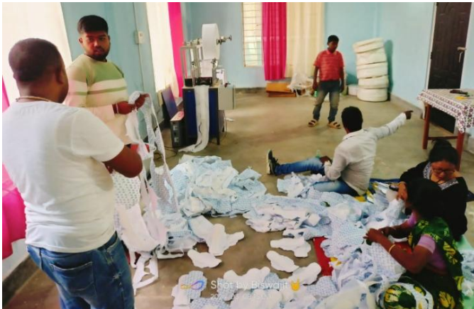
(Pics of Sanitary Pads)