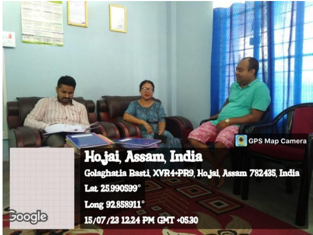
(DCPU official inspecting registers and Documents of Life Foundation)