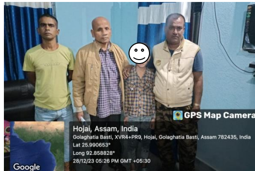
(Children rescued by Police and handing over to Life Foundation)