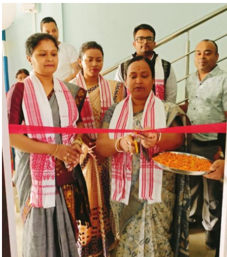
(Inauguration of Sanitary Pad Making Machine)