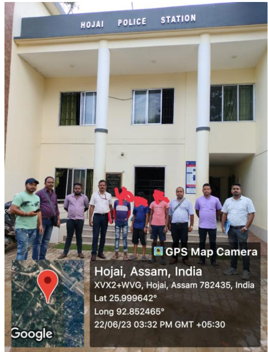
(Secretary of Life Foundation posing for lens with Labour Inspector, CHILDLINE and DCPU officials before and after rescue of children from different shops and stores of Hojai District)