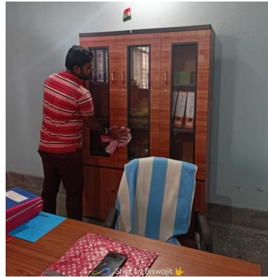
(Cleaning of Computer table and wardrobe)