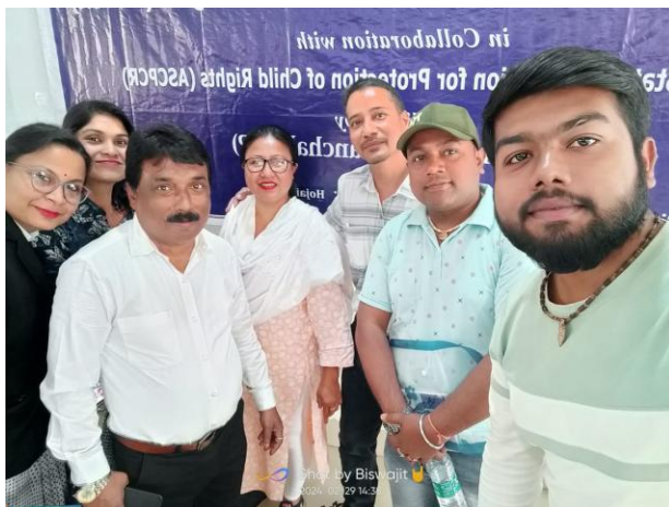
(CWC, DCPU and Life Foundation members)