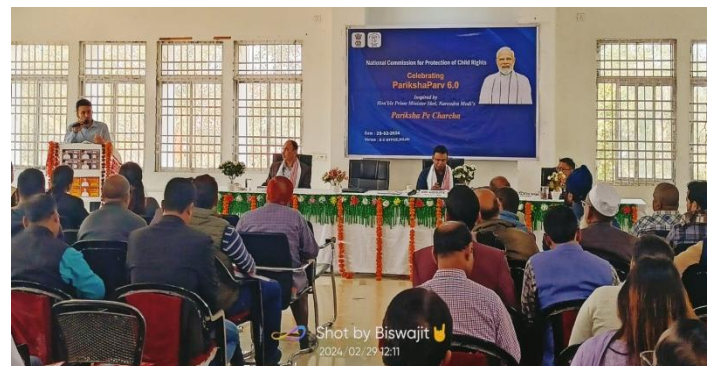
(Celebrating Pariksha Parv 6.0 in DC Conference Hall, Hojai)