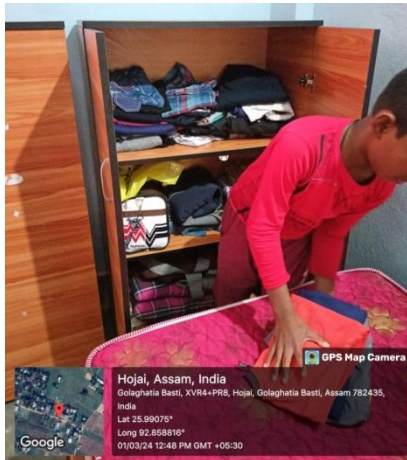
Hojai, Assam, India Golaghatia Basti, XVR4+PR8, Hojai, Golaghatia Basti, Assam 782435, India Lat 25.99075° Long 92.858816° 01/03/24 12:48 PM GMT +05:30