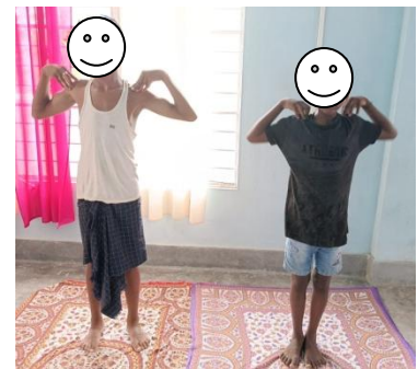
(Children performing Daily Yoga in CCI)