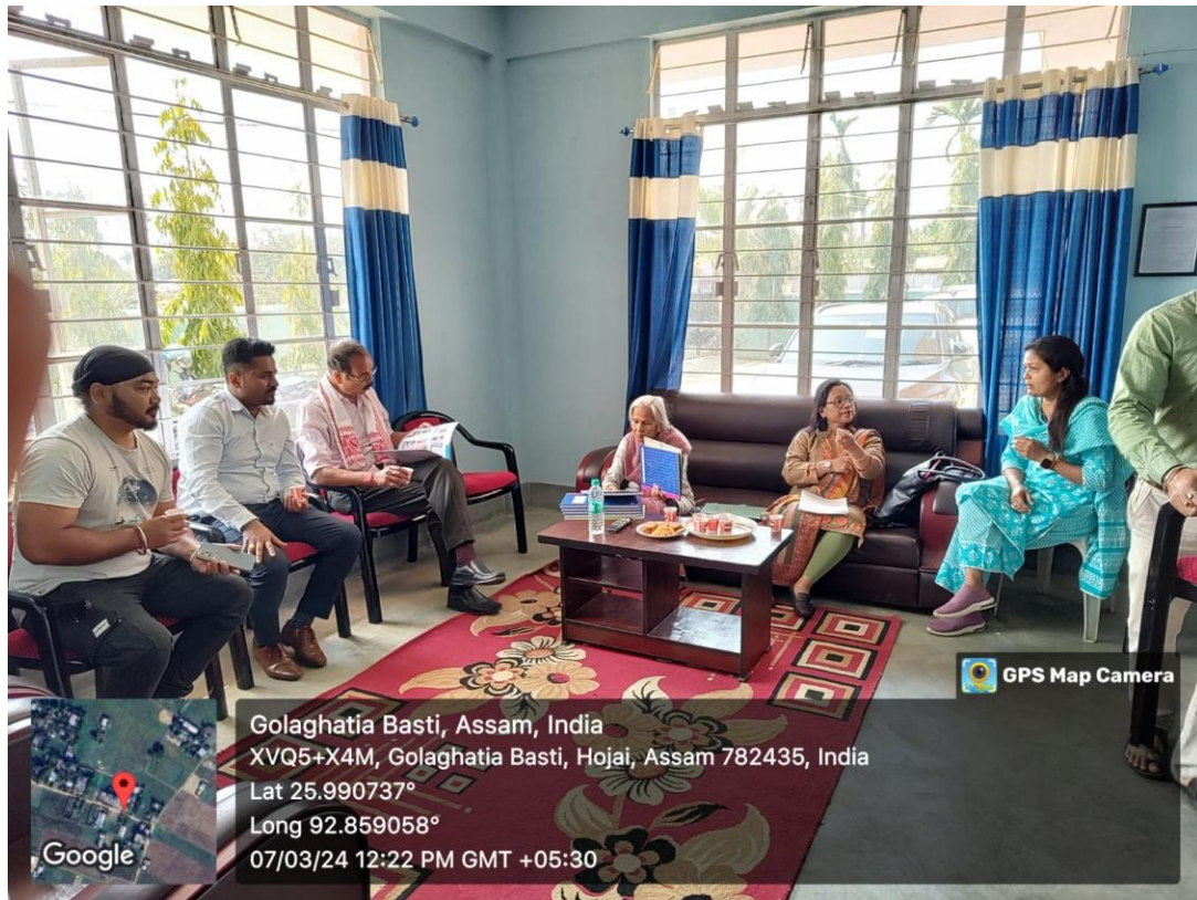
(Inspection of Child Care Institution by High Court Committee inspection team at Life Foundation on 07.03.2024)