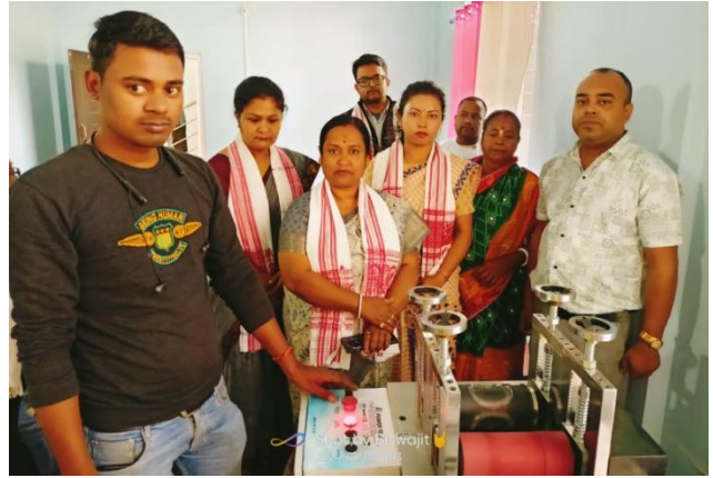
(Live Demo of Sanitary pad machine)