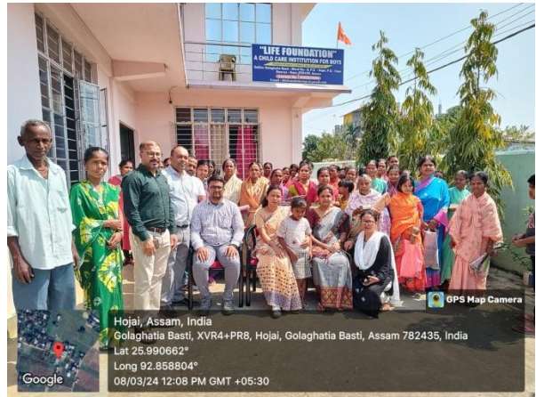
(Group Photo on International Women's Day)