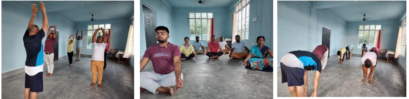
(Staffs of LIFE FOUNDATION performing YOGA on Yoga Day)

Yoga in Daily Life is a system of practice consisting of eight levels of development in the areas of physical, mental, social and spiritual health. When the body is physically healthy, the mind is clear, focused and stress is under control. This gives the space to connect with loved ones and maintain socially healthy relationships.