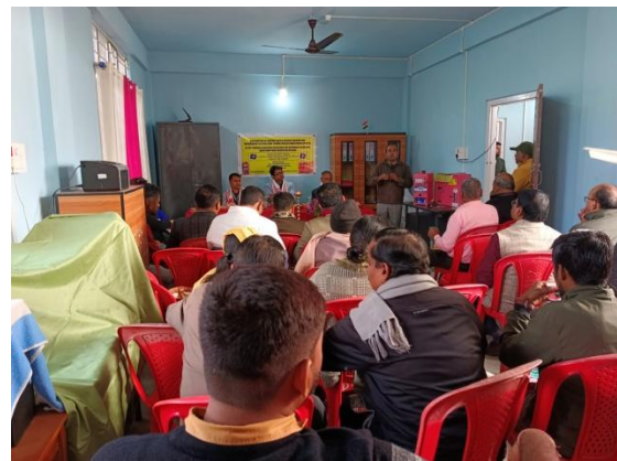
(Govt. School Teachers and Principals of Hojai)