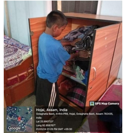
Hojai, Assam, India Golaghatia Basti, XVR4+PR8, Hojai, Golaghatia Basti, Assam 782435, India Lat 25.990723° Long 92.858767° 01/03/24 01:25 PM GMT +05:30