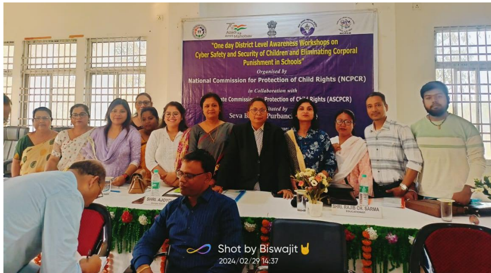
(Group photo with ASCPCR members, CWC Members and DCPU members after the program)

The team of Life Foundation attended One-day Awareness Workshop on Cyber safety and Security of Children and Eliminating Corporal Punishments in Schools. The program was organized by National Commission for Protection of Child Rights in collaboration with Assam State Commission for protection of Child Rights at DC conference Hall, Hojai on 29.02.2024.