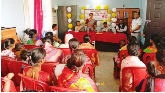
(Speech by Resource Person)