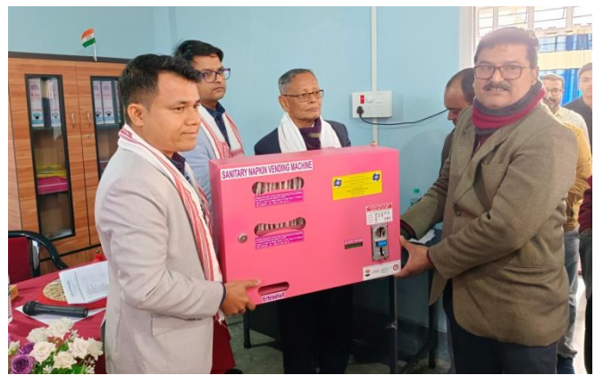
(School teacher receiving the Vending Machines and Incinerator)