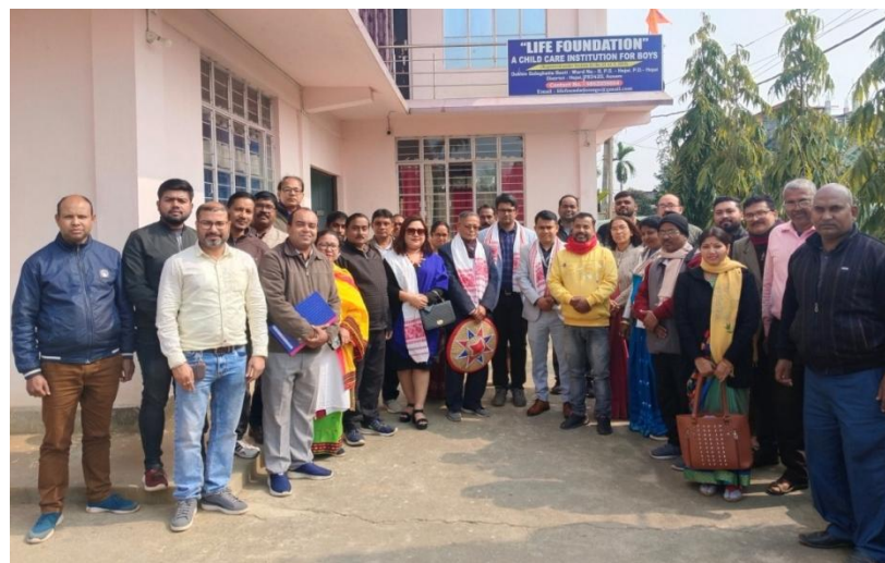
(Group photo of the Participants)