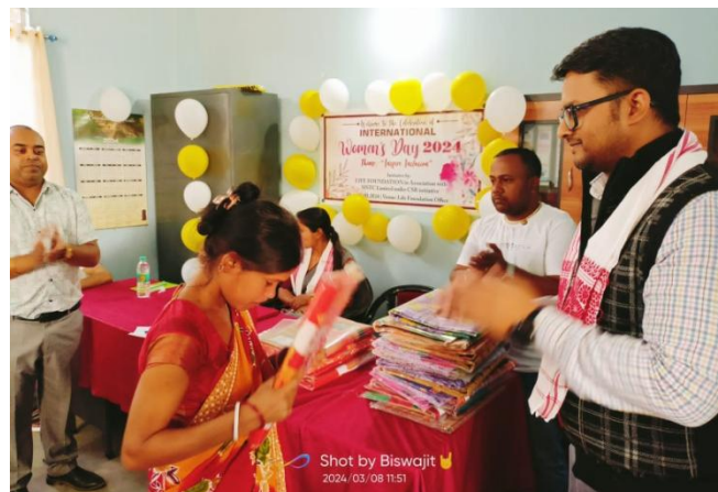
(Distribution of Saree on occasion of Women's Day)