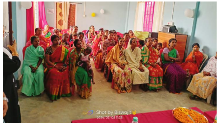
(Participants patiently hearing the speech of Resource Person on International Women's Day)