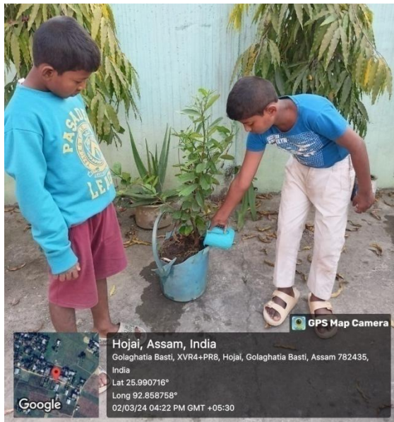
Hojai, Assam, India Golaghatia Basti, XVR4+PR8, Hojai, Golaghatia Basti, Assam 782435, India Lat 25.990716° Long 92.858758° 02/03/24 04:22 PM GMT +05:30