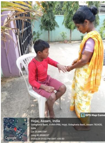
Hojai, Assam, India Golaghatia Basti, XVR4+PR8, Hojai, Golaghatia Basti, Assam 782435, India Lat 25.990734° Long 92.858813° 01/03/24 01:02 PM GMT +05:30