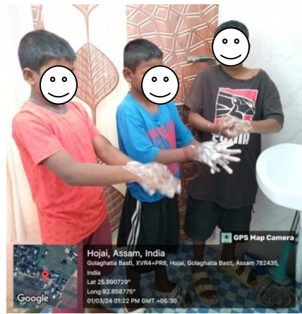
Hojai, Assam, India Golaghatia Basti, XVR4+PR8, Hojai, Golaghatia Basti, Assam 782435, India Lat 25.990729° Long 92.858775° 01/03/24 01:22 PM GMT +05:30