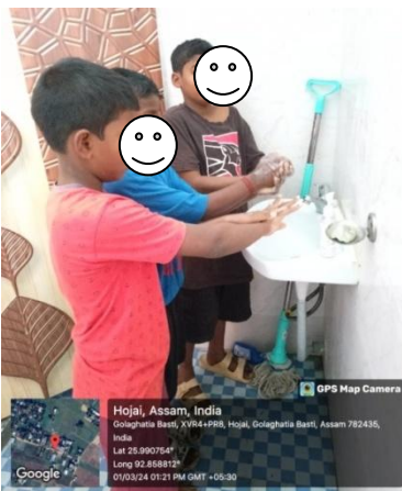
Hojai, Assam, India Golaghatia Basti, XVR4+PR8, Hojai, Golaghatia Basti, Assam 782435, India Lat 25.990734° Long 92.858813° 01/03/24 01:21 PM GMT +05:30